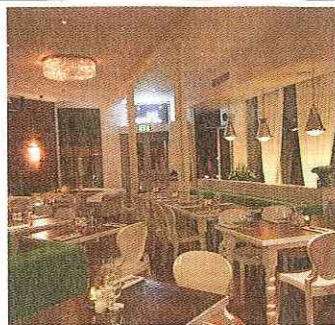
Not a raffia-clad Chianti bottle in sight

generous, leaving little room for manoeuvre when it comes to choosing from the rather conventional dessert list. In this case, a glassful of affogato (vanilla ice-cream topped with espresso) with a few biscotti to dunk over the usual tiramisu and panna cotta.